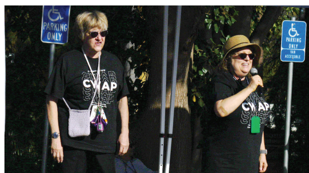
Area Agency on Aging staff on stage promoting the Countywide Area Plan Survey for Older Adults.

Keep an eye out for pre-registration information so you can register online for the 2024 Healthy Living Festival at https://www.usoac.org/ .